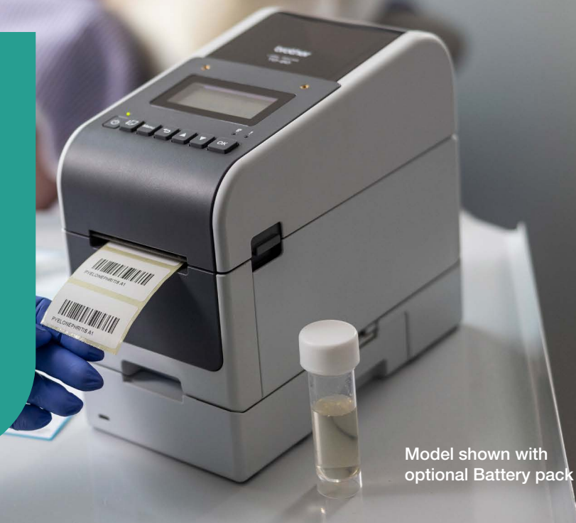
Model shown with optional Battery pack

The TD-2300 range comes as standard with a user guide, USB-C cable, AC adapter and our powerful P-touch labelling software. As each printing application is different, there are numerous optional extras available to fulfil virtually any requirement (see below). Such customisation can help keep costs to a minimum by selecting only those options which you require.