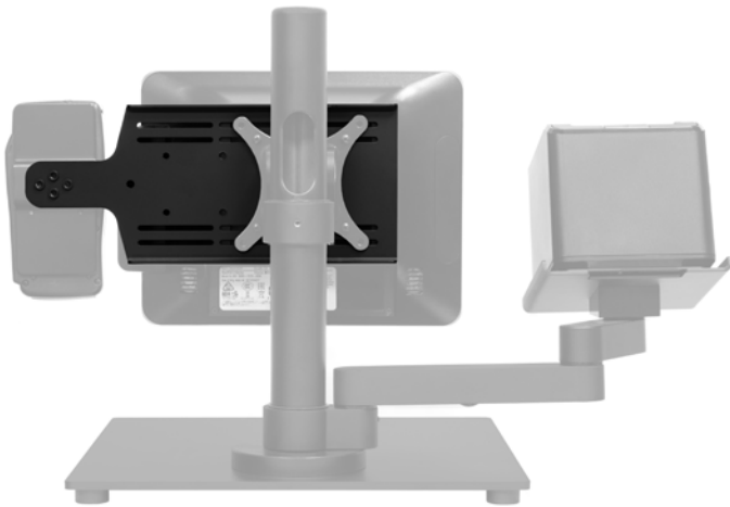
MNSL10-12B on Modular Now Pole Mount

Our Modular Now slider bracket offers the ultimate in flexibility with multiple mounting points for your display. Durable construction ensures your technology stays safe.