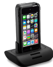
CHARGING STATION (1-UNIT)

Power your workflow from a single station. Charge up to five Infinea mPOS devices simultaneously with a simple to use, drop and charge design. Whether you charge your devices overnight or keep a second set ready to go, The Infinea mPOS Charging Station LED indicators will tell you when your devices are fully charged and ready to mobilize your enterprise.