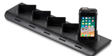
CHARGING STATION (5-UNIT)