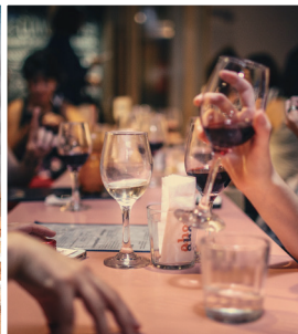
FOOD & BEVERAGE SERVICE