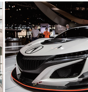
EVENTS & ENTERTAINMENT