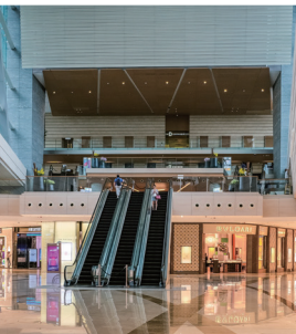
RETAIL & HOSPITALITY