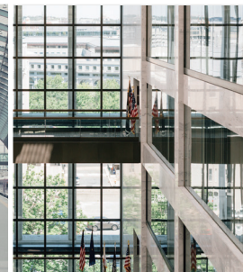
GOVERNMENT & CORPORATE