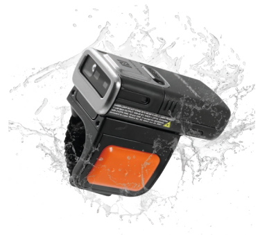
IP65 WATER/DUST RESISTANCE