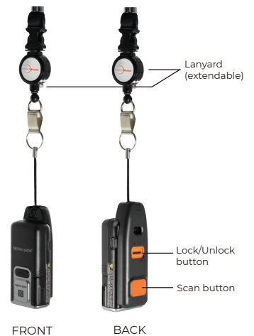
USB-C SLED (WITH LANYARD)