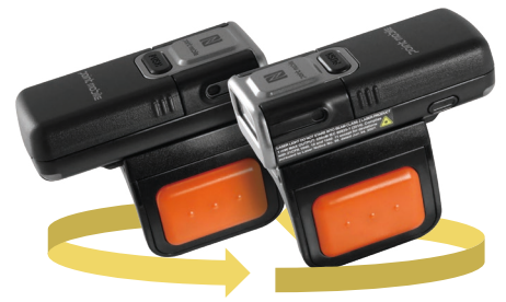
AMBIDEXTRIOUS RING TRIGGER

For the further inquiry, please contact: service@pointmobile.com