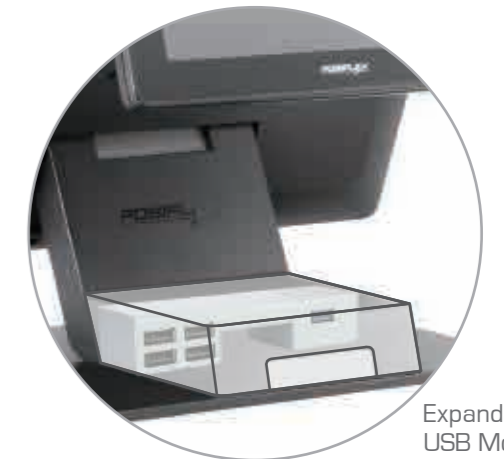
Expandable USB Module

Advanced cable management design delivers a truly clutter-free station. The standard base can house the optional Powered USB or USB extension module, while the optional base integrates a UPS backup (RB-5000) for the event of a power failure.