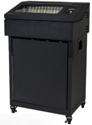
Zero Tear for on-demand printing without forms waste.

Only Line Matrix offers proven high reliability, uptime performance and environmental responsibility. All delivered by the power of OpenPrint from Printronix.