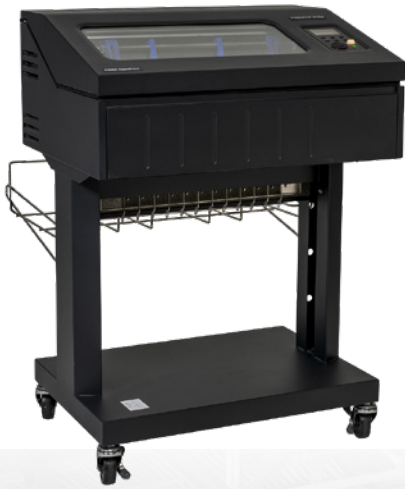
Open Pedestal for easy forms access with a small, maneuverable footprint.