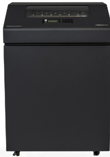
Quiet Cabinet for large, unattended and secure print jobs.