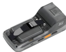
Fingerprints Biometric Module